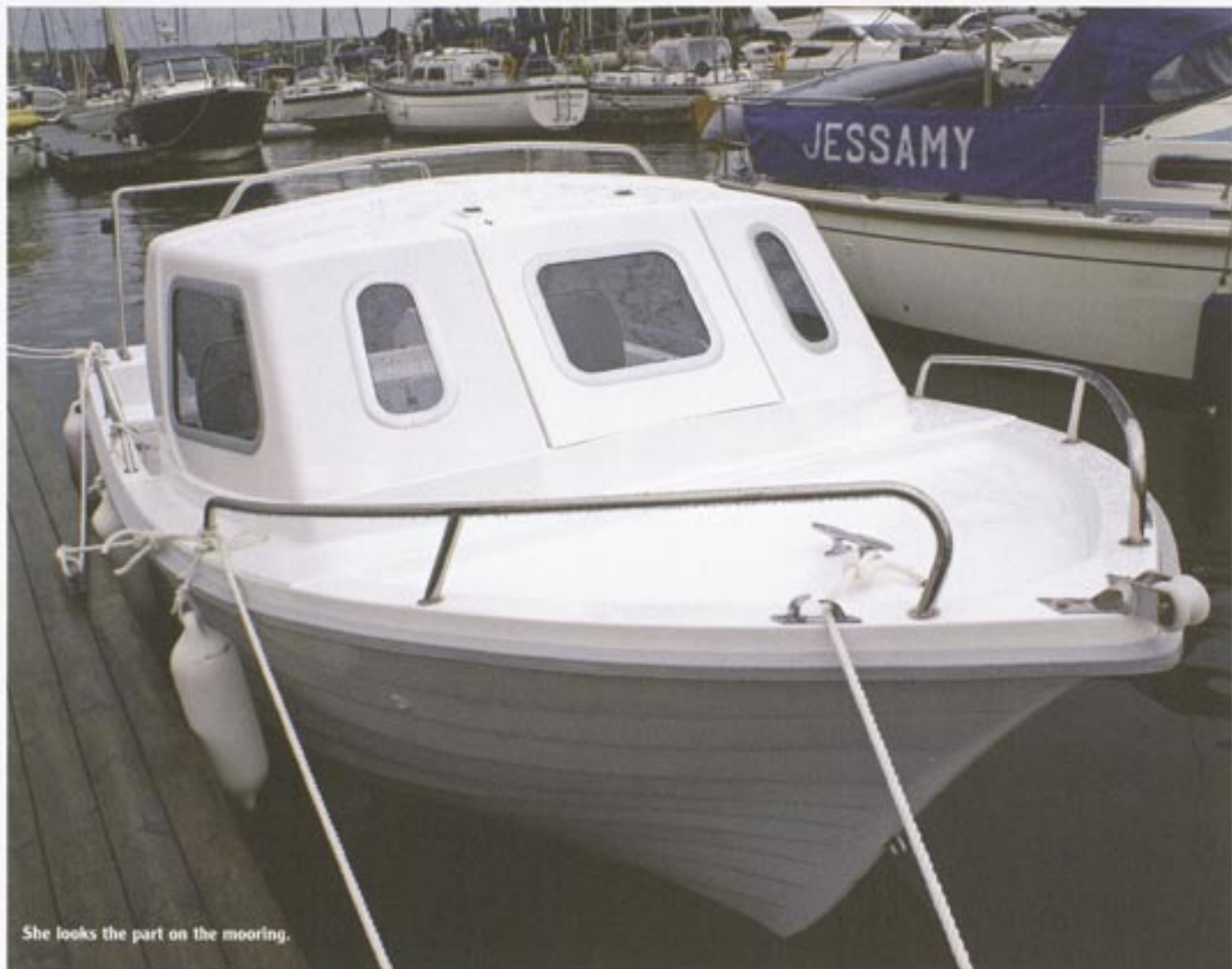
She looks the part on the mooring.